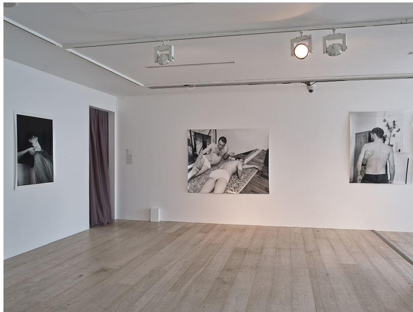
WHAT'S LOVE GOT TO DO WITH IT (INSTALLATION VIEW) AT HAYWARD GALLERY PROJECT SPACE 2014