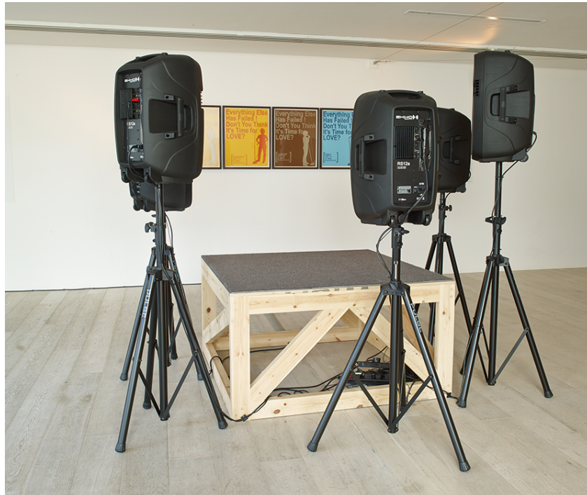
SHARON HAYES, EVERYTHING ELSE HAS FAILED! DON'T YOU THINK IT'S TIME FOR LOVE?, 2007. WHAT'S LOVE GOT TO DO WITH IT (INSTALLATION VIEW) AT HAYWARD GALLERY PROJECT SPACE 2014

What's love got to do with it? Well, the artists exhibiting in the Hayward's Project Space all have varying opinions on the subject. Specifically on the gestures both visual and verbal that we use to communicate love and the play of power between lovers as levels of longing and desire shift.